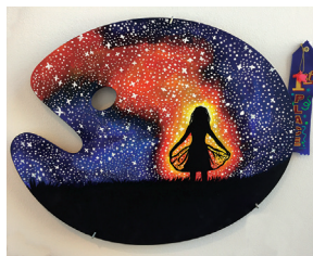
1 st Place Teen Rachel Pepin