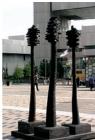
Exhibit ends March 1.