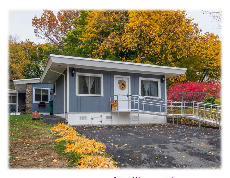
Accessory dwelling units