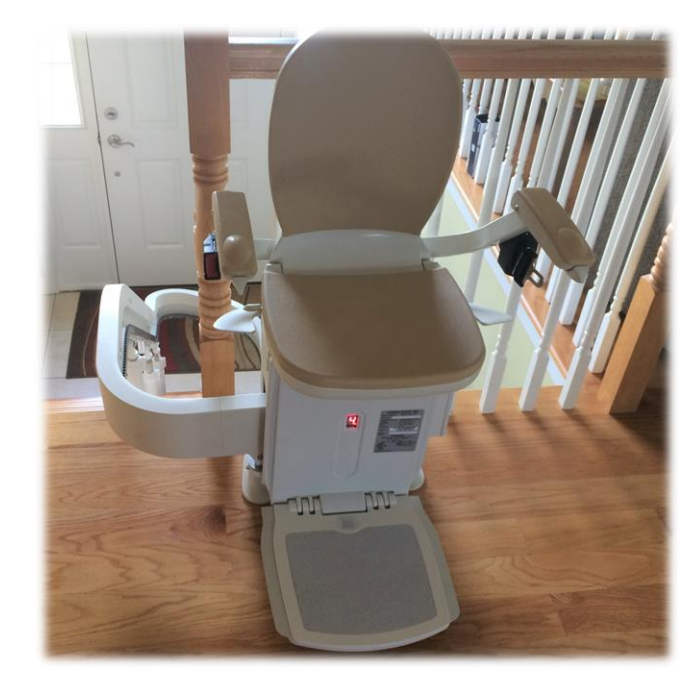
Stair-lifts and platform lifts