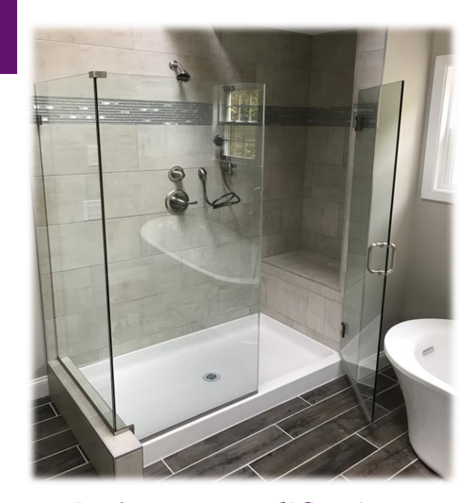
Bathroom modifications (walk-in showers, grab-bars, etc.)