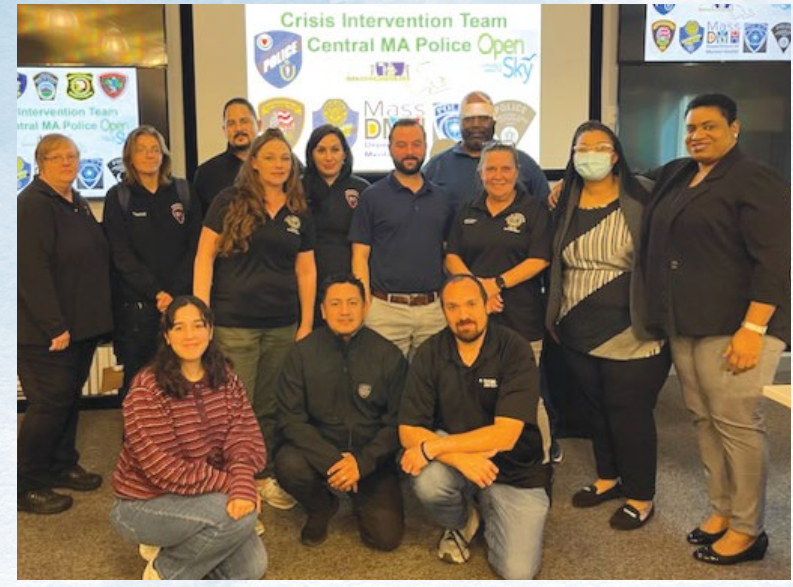
Graduating class of a CIT Dispatch Training including staff from the Worcester Emergency Communications Center.